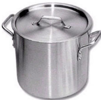
STOCK POTS AVAILABLE IN 6, 10, 15 & 20 GALLON

23 CUBIC FEET 110 VOLT (8 AMP) ON HEAVY DUTY CASTERS