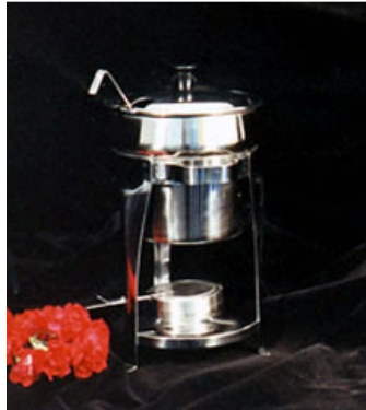
3 QT SAUCE WARMER