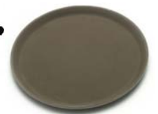
WAITER TRAY STAND TRAYS AVAILABLE IN: 14" ROUND & 22" X 27" OVAL