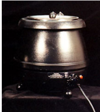
10.5 QT SOUP KETTLE